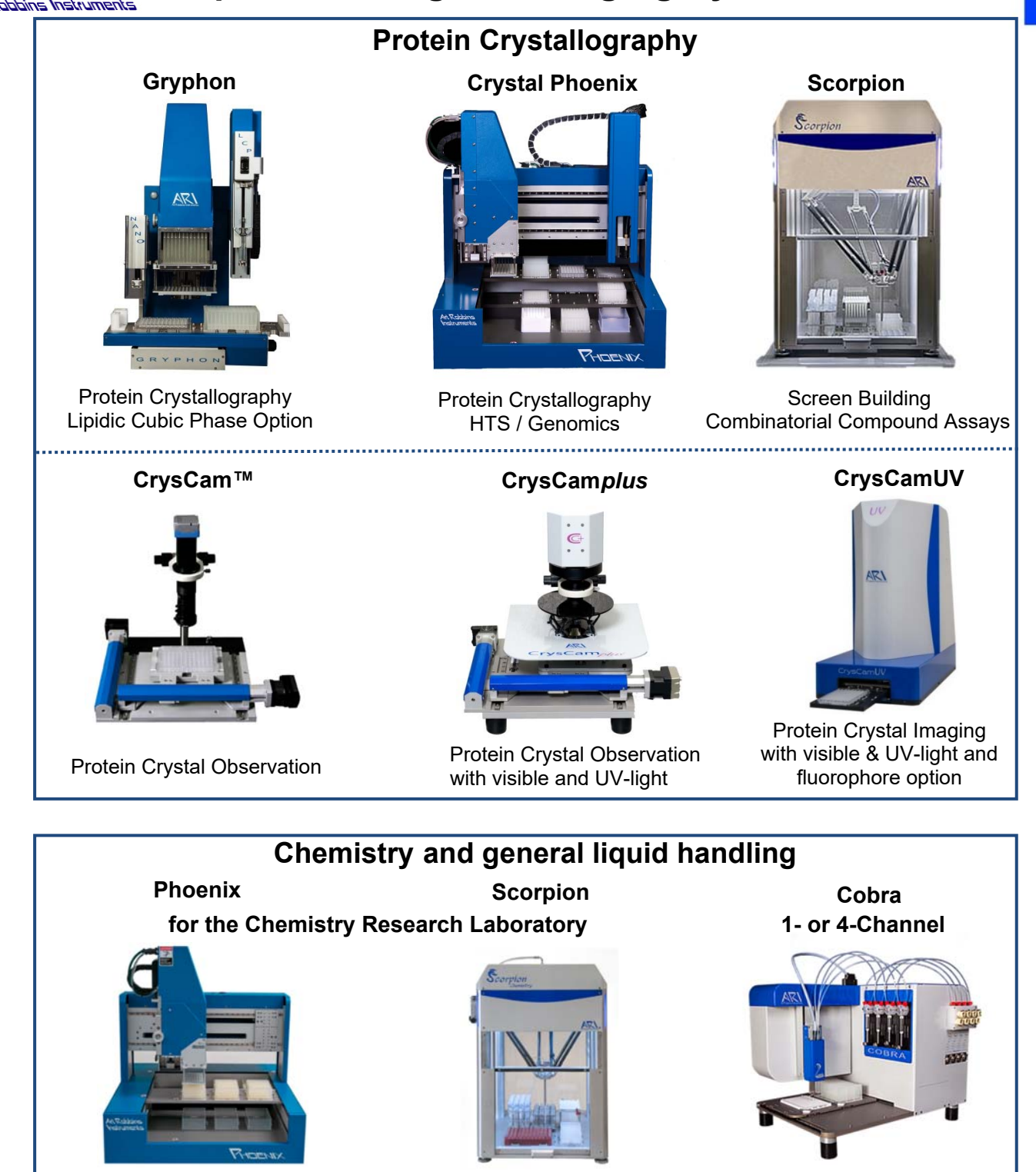
Organic Solvent Transfers Enzyme Optimization