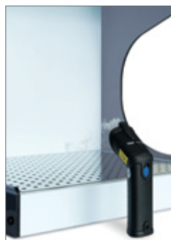
Flow demonstrated with a Dräger Flow Check.