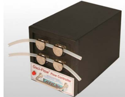
Figure 27. Osci-Flow ® Controller